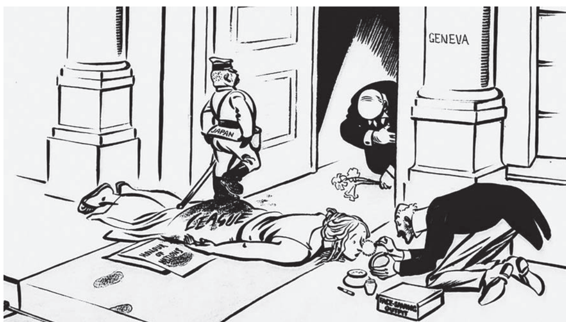
A cartoon published in Britain, January 1933. It is entitled 'The doormat'. The text on the left reads 'Honour of Nations'. The text on the box on the right reads 'Face-saving outfit'. The figure on the right is a member of the British government.